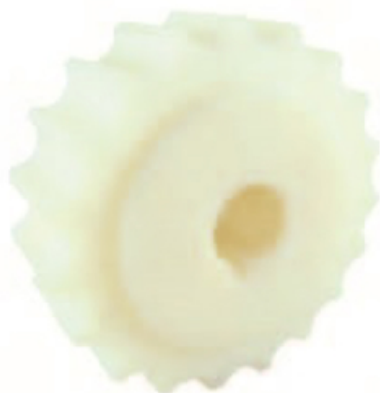
ENGRENAGEM USINADA (PARA CORRENTES 8157, 8857M)