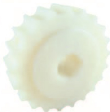
ENGRENAGEM USINADA (PARA CORRENTES 512/515)